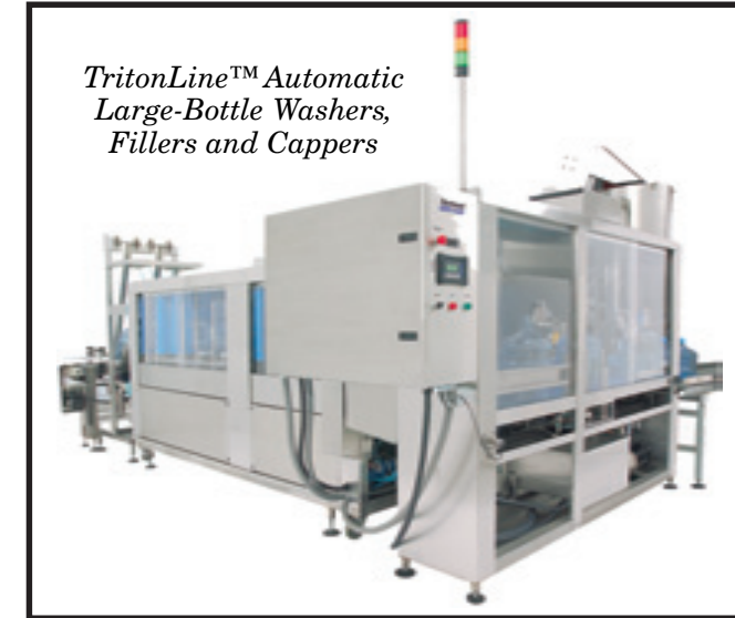
TritonLine™ Automatic Large-Bottle Washers, Fillers and Cappers

Norland Int'l. Inc. Your Complete Source