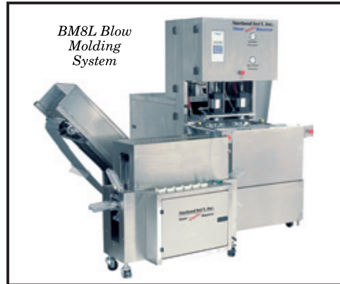
BM8L Blow Molding System