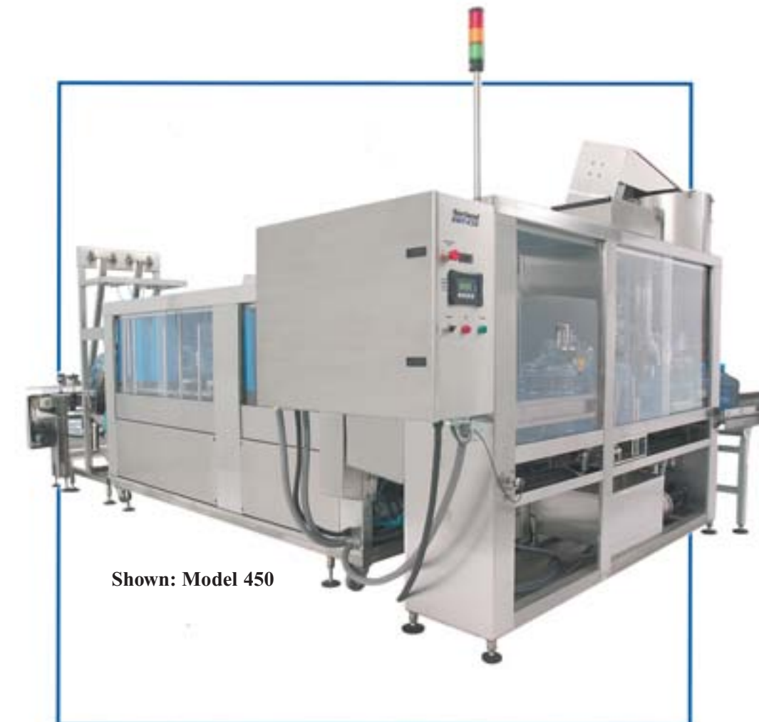
Shown: Model 450

Automatic Bottle Washer/ Filler/Cappers: 450-, 600- and 900 BPH Available