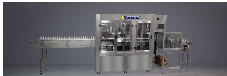
GlassPak (Produces Glass Bottles)